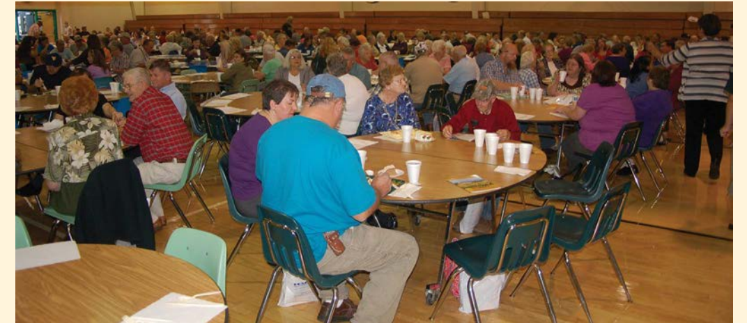
Attendees at last year's Annual Meeting enjoy the pork barbecue meal.