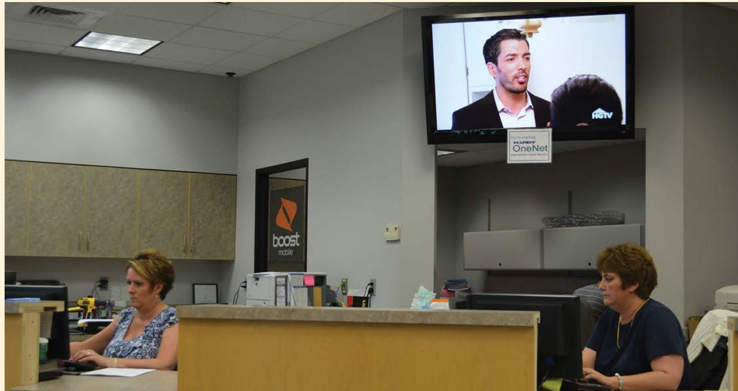
Visit any of our offices, such as Moorefield shown here, and see our high-definition TV picture with OneNet.