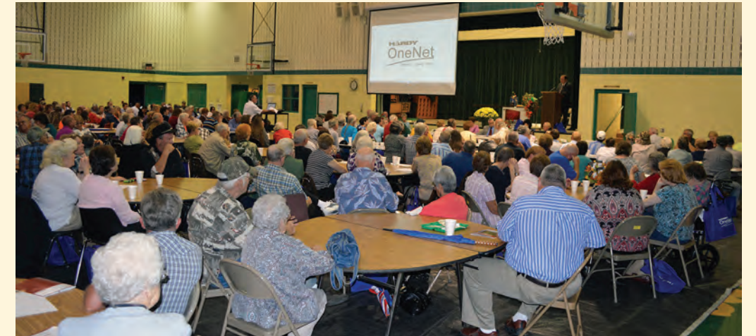
Hardy's annual meeting will return to the East Hardy High gym this October after East Hardy Early Middle accommodated us in 2014 due to the construction project at the high school.