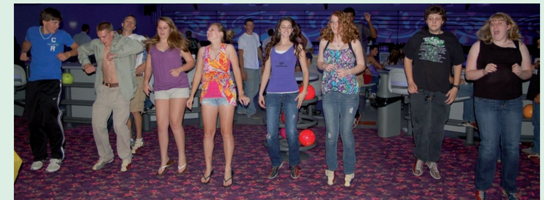
East Hardy High's Class of 2011 dances the "Cha Cha Slide" at Hardy's After-Graduation Party.

Vendors from Hardy and several surrounding counties displayed their products and services in a festive atmosphere complete with music, food, and even Bob the Builder for the kids.