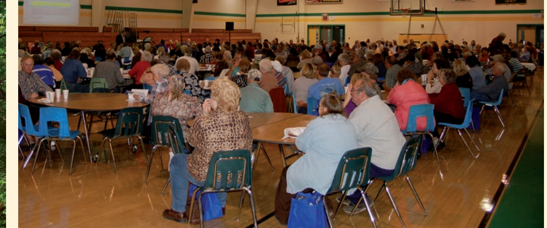
Attendees at Hardy's 2010 Annual Meeting of Members packed the gymnasium at East Hardy High School.