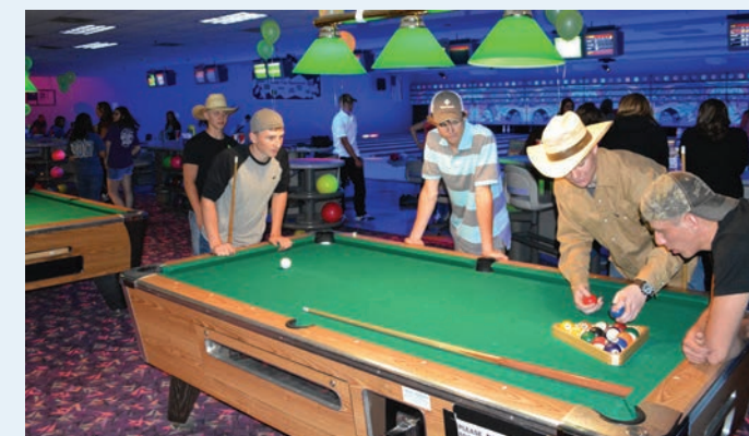
East Hardy High 2017 graduates, faculty and guests enjoy the After-Graduation Party at South Branch Potomac Lanes. Hardy Telecommunications sponsors the party each year with the support of local businesses and residents.

Hardy Telecommunications thanks everyone who donated items or otherwise supported the EHHS After-Graduation Party, held May 26 at South Branch Potomac Lanes. We had a great turnout from East Hardy High graduates and faculty. We appreciate your support in giving East Hardy students a place to celebrate their accomplishments in a safe, alcohol-free environment. The party would not be successful were it not for the generosity of the community members who contribute to its success.